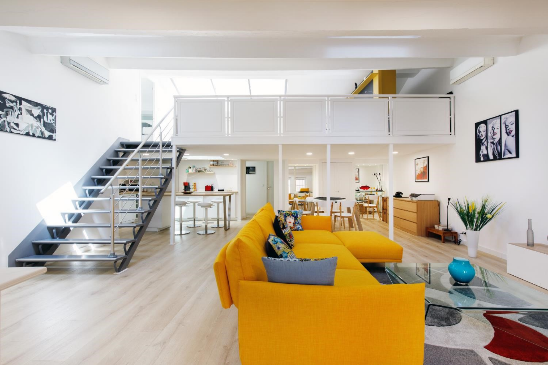
Staircase leading to the mezzanine area