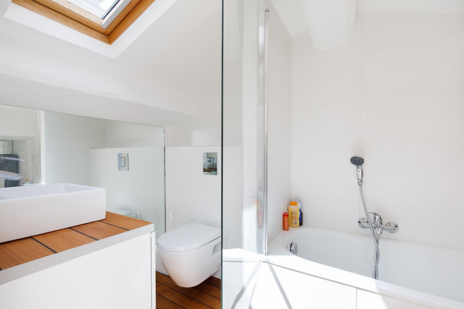
The toilets in the bathroom