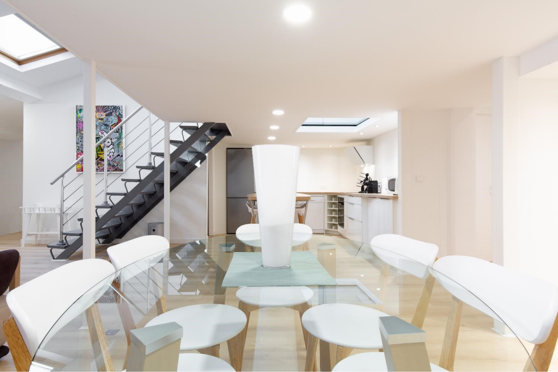
View from the dining area on the US kitchen