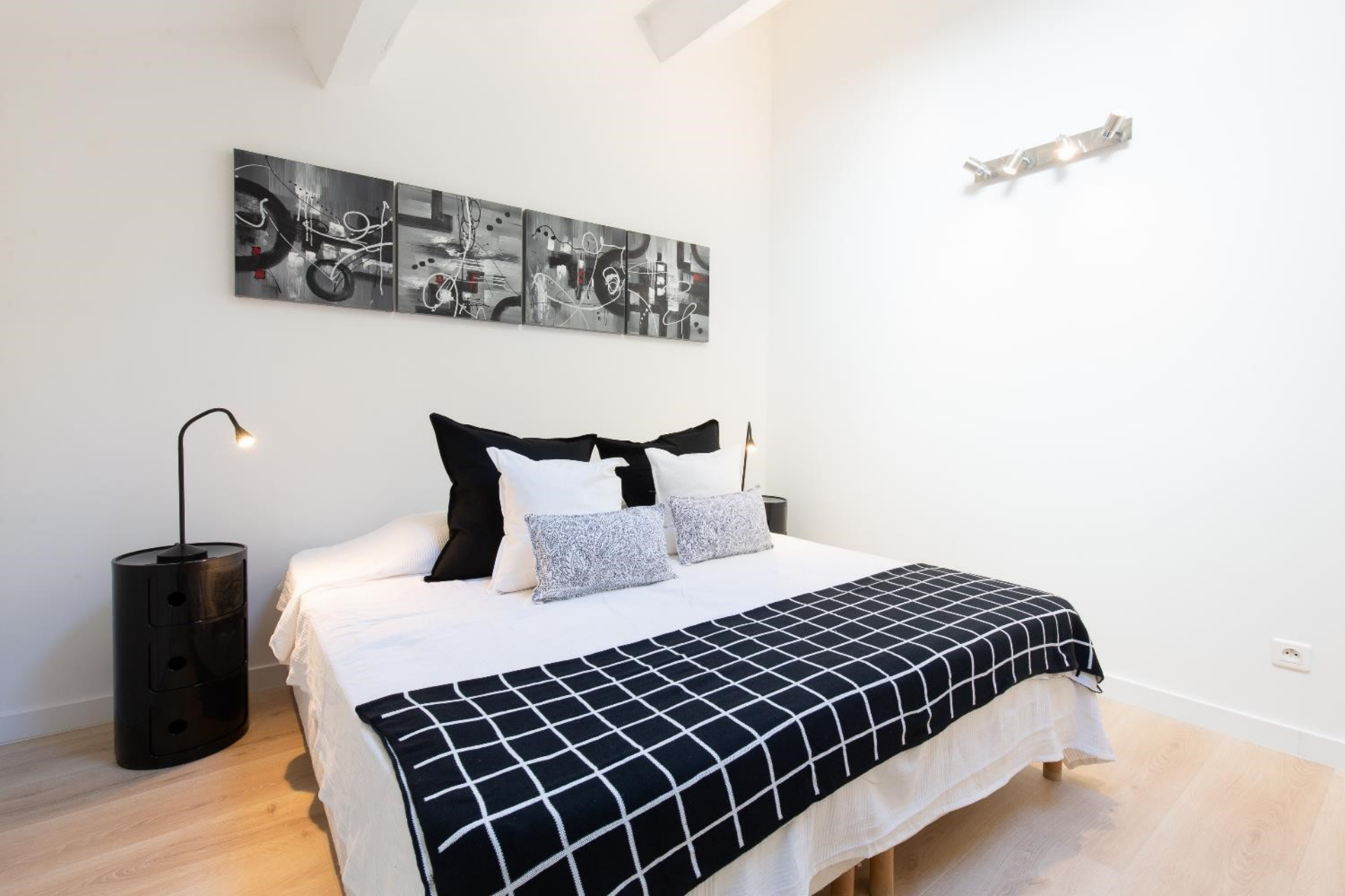
Another view of the 1st bedroom