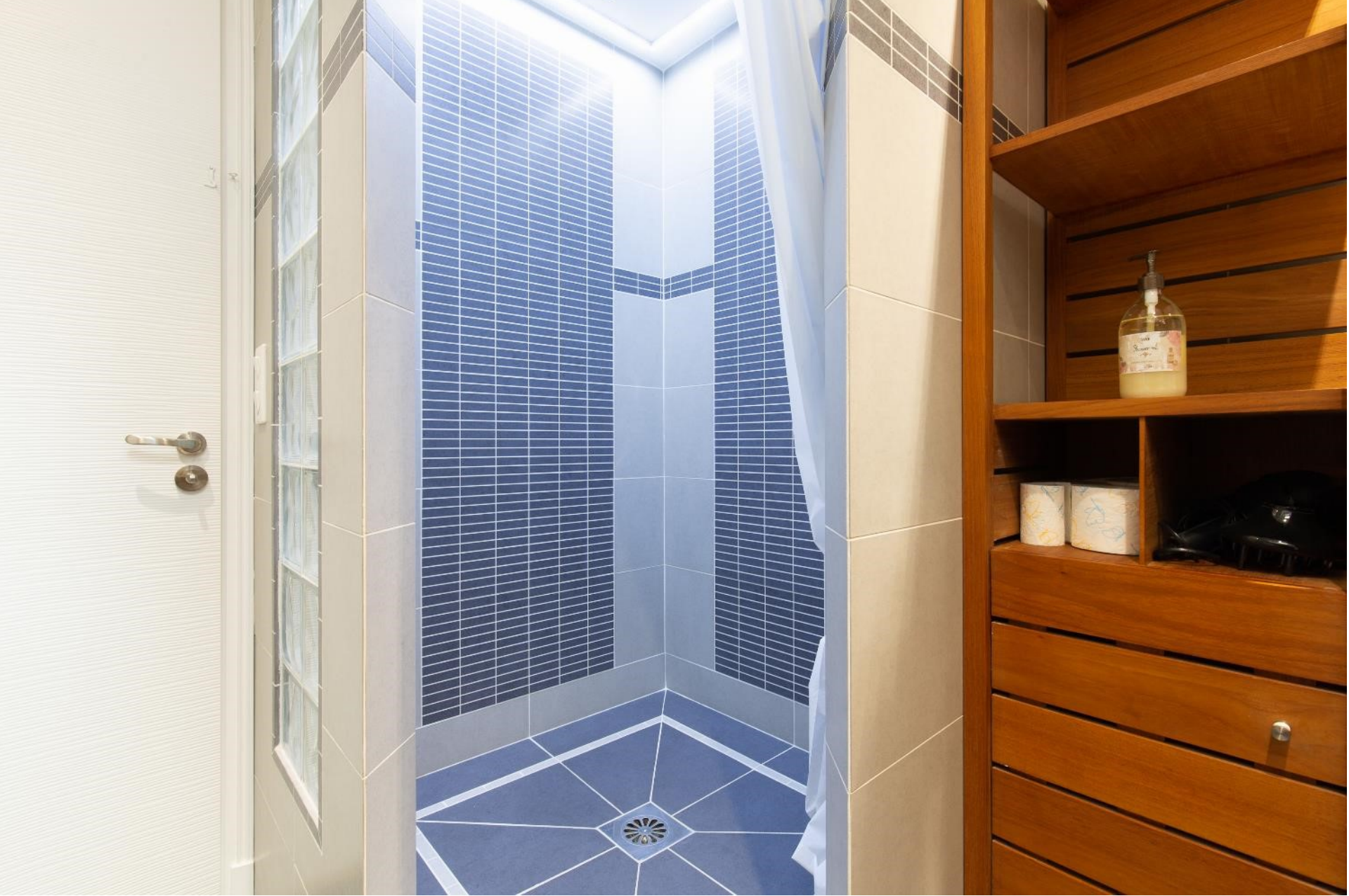
Zoom on the shower area