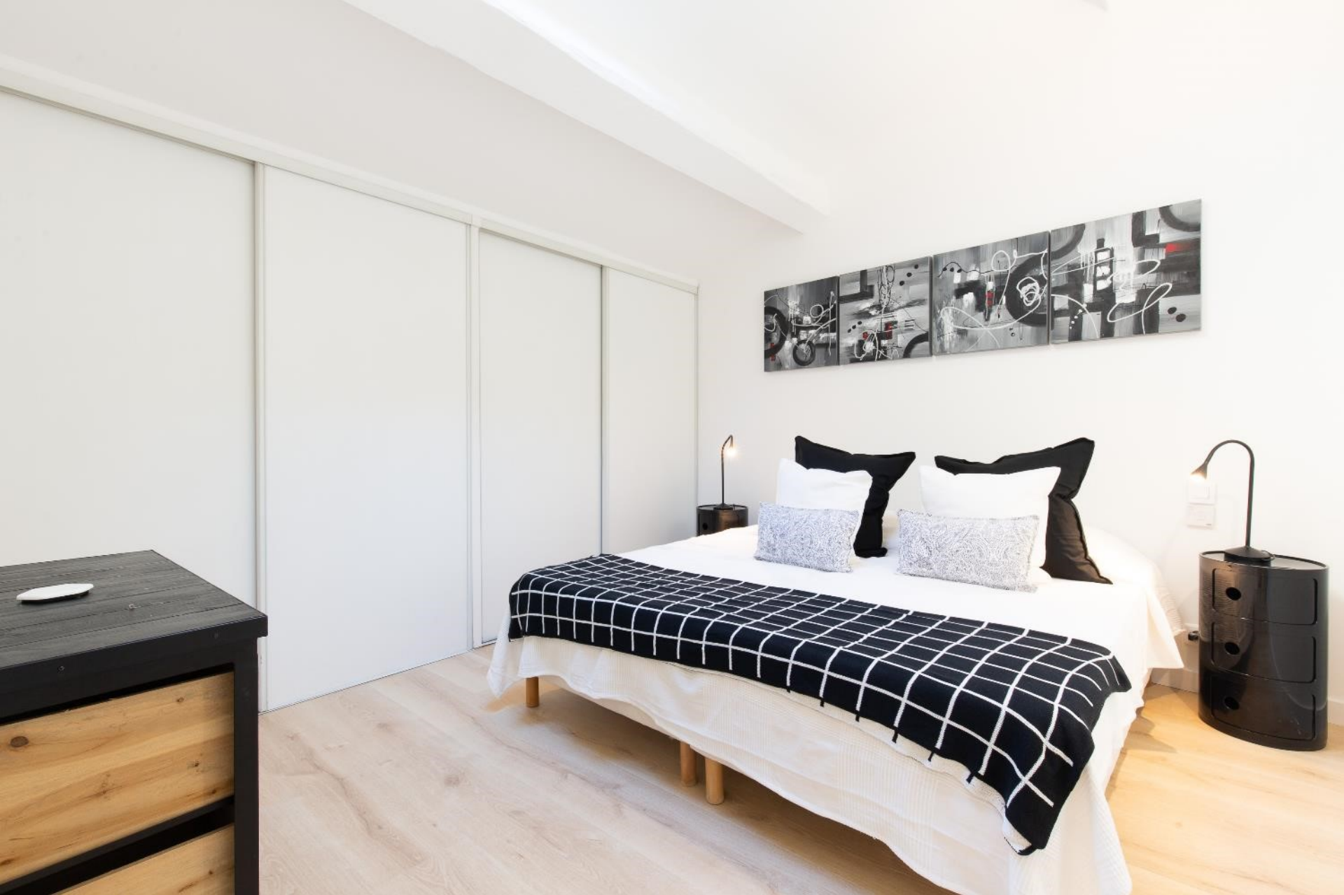
1st bedroom with 2 single beds that can be made as double