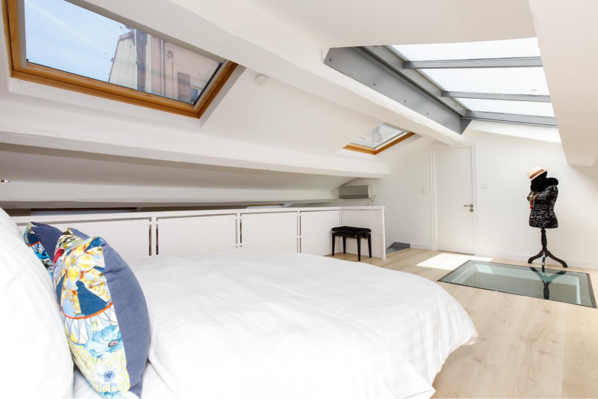
The mezzanine bedroom with its 2 single beds