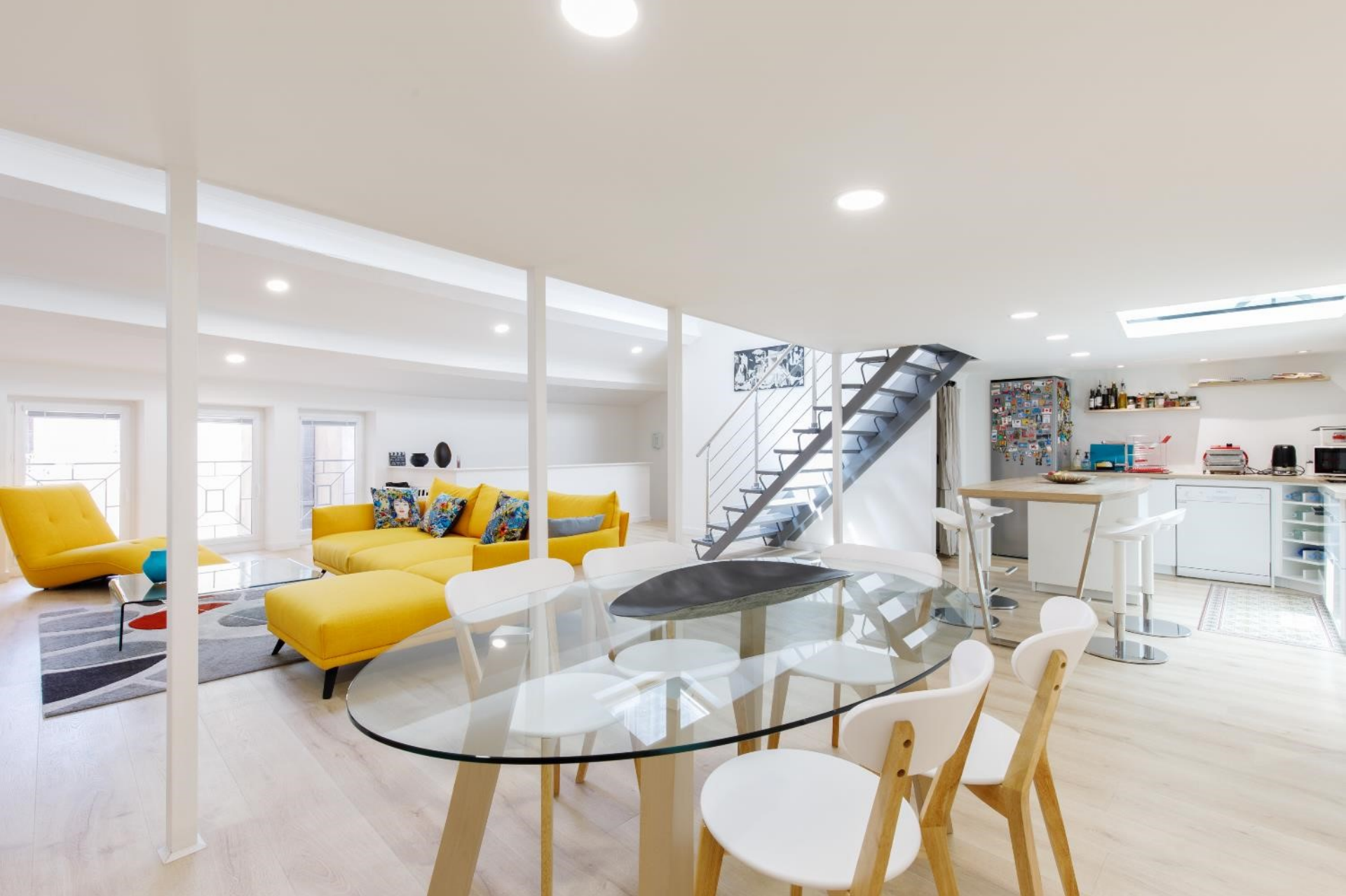
Another view of the dining area