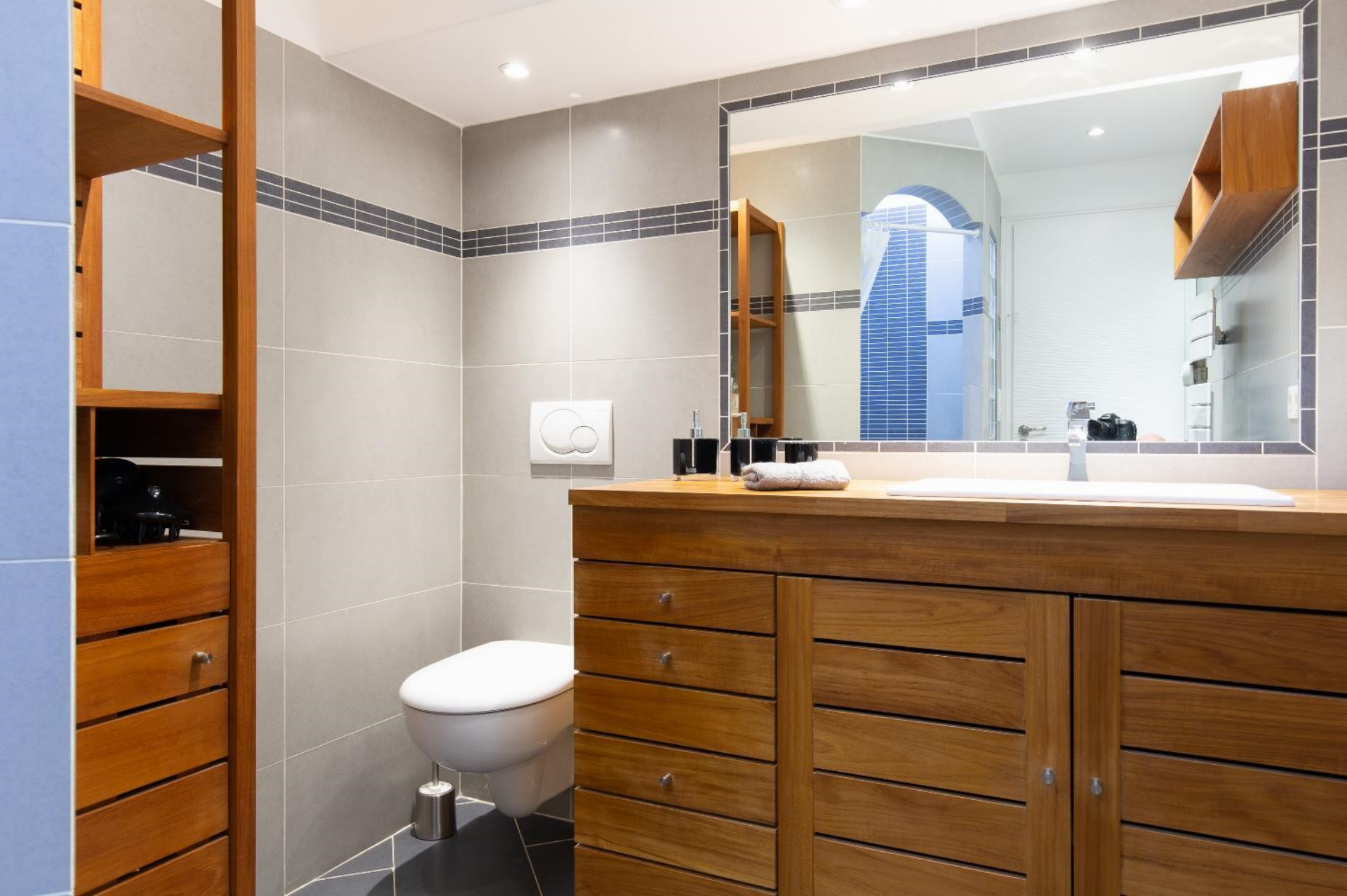
1st shower room with toilets