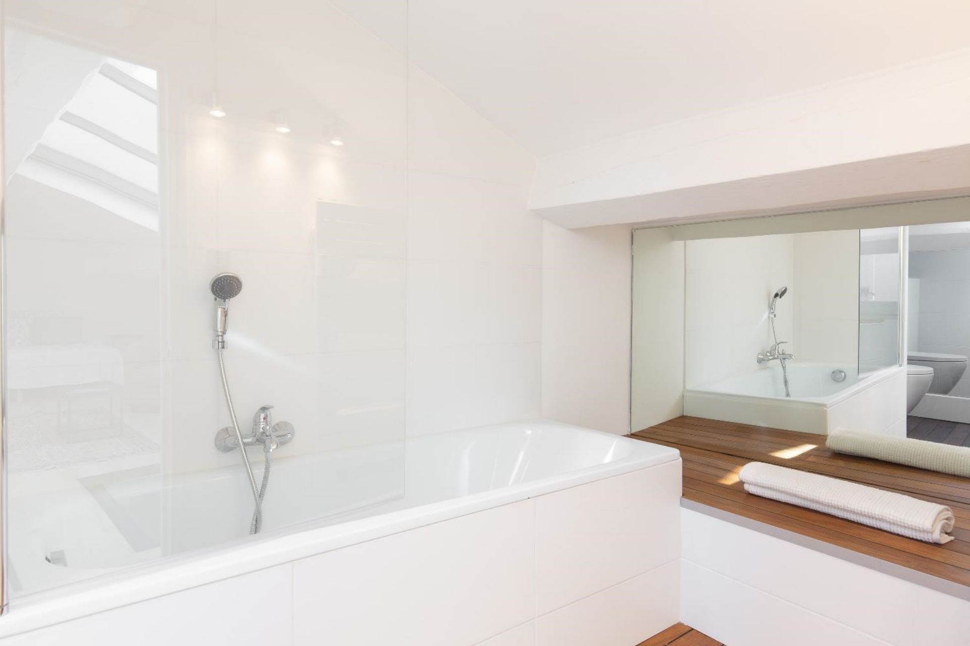
The 2 nd bathroom with toilets that belongs to the mezzanine bedroom