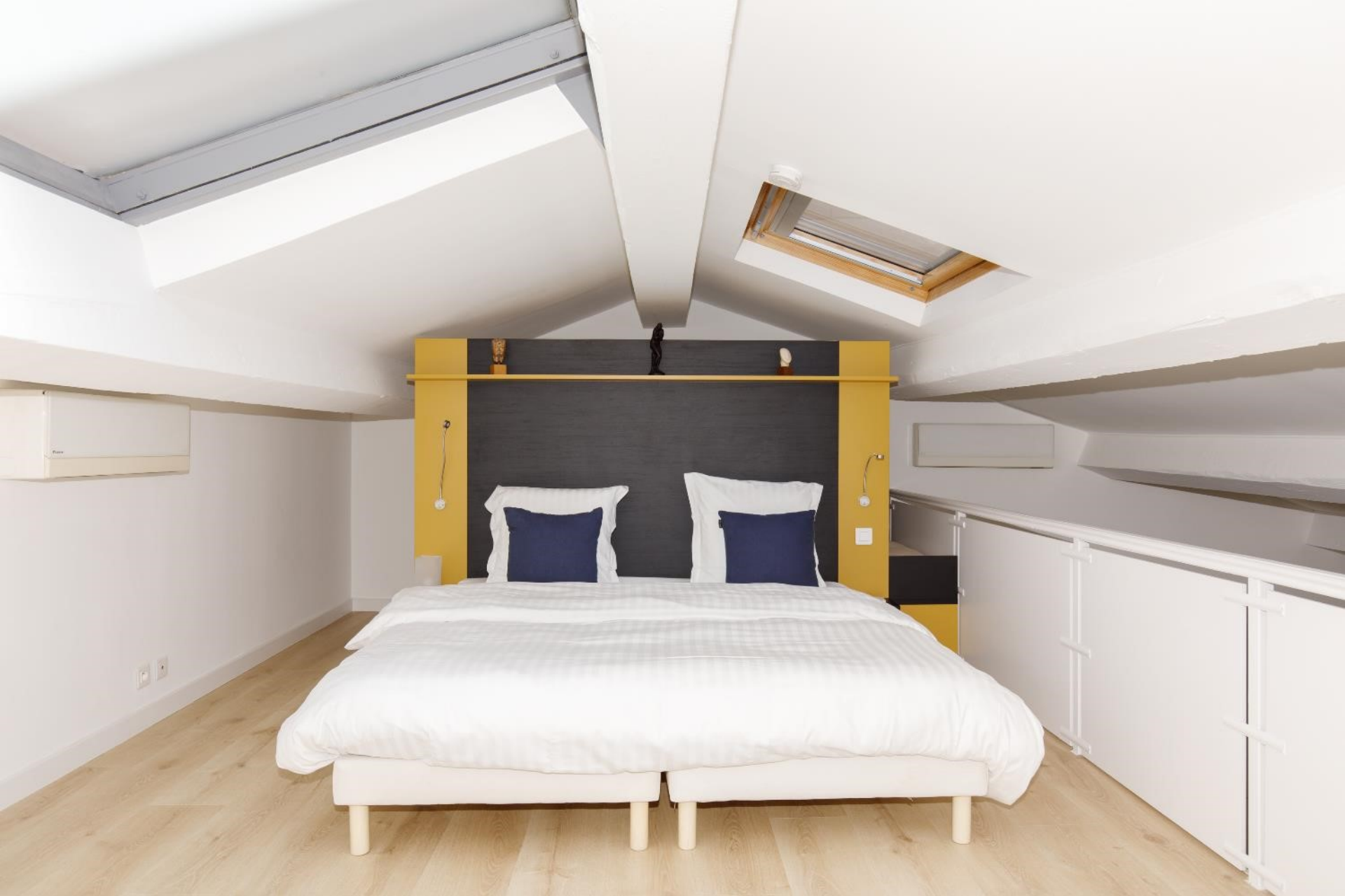
Another view of the mezzanine bedroom with dressing area behind the bed