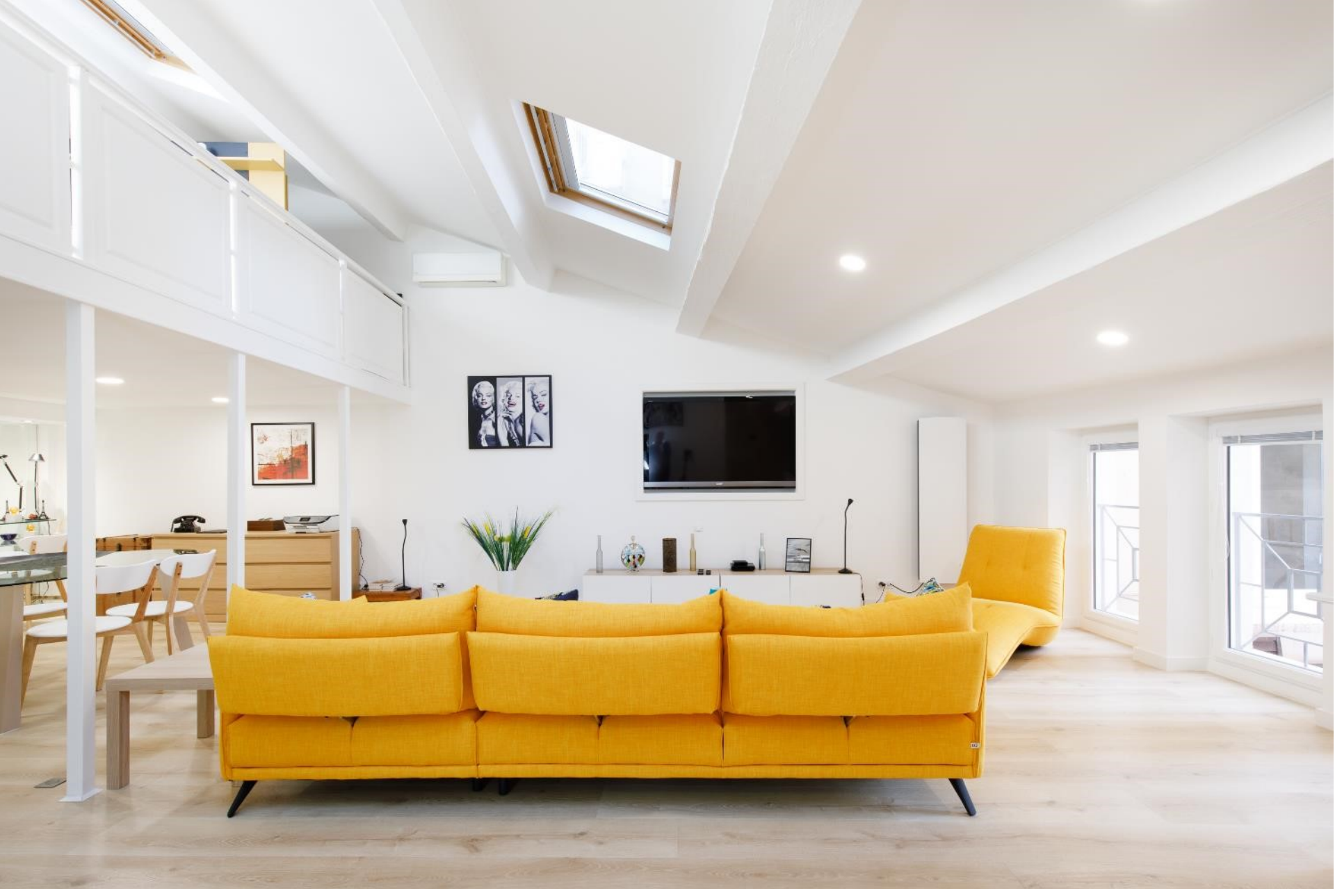
Zoom on the living room