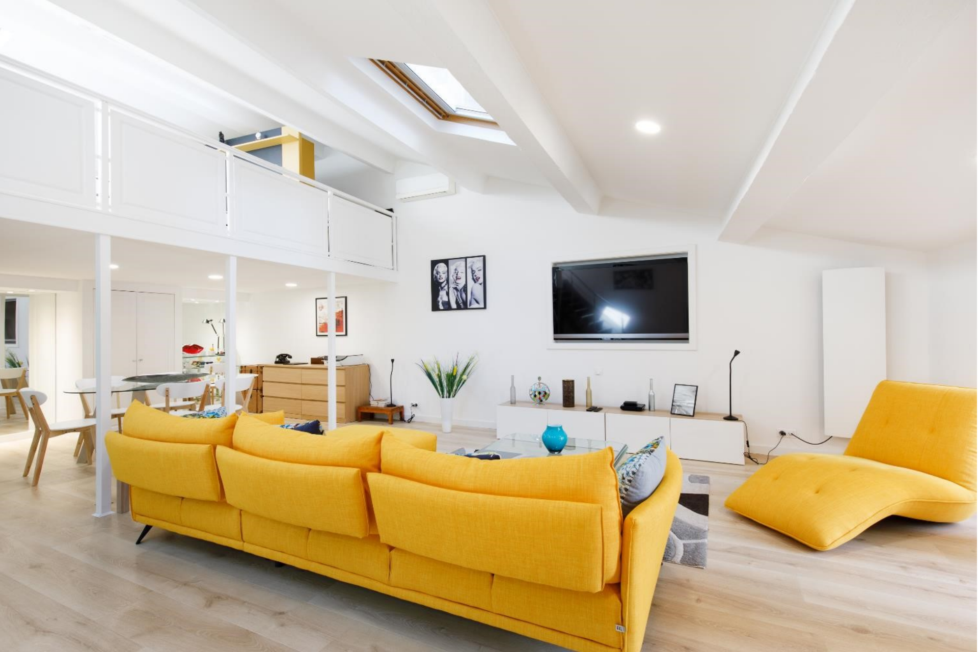
Zoom on the TV area