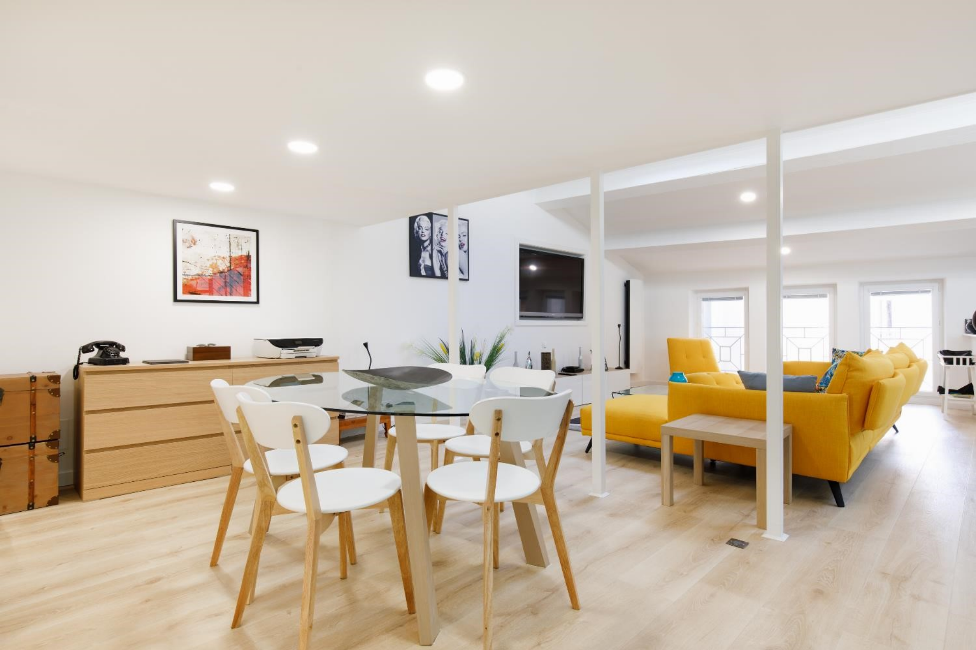
The dining area