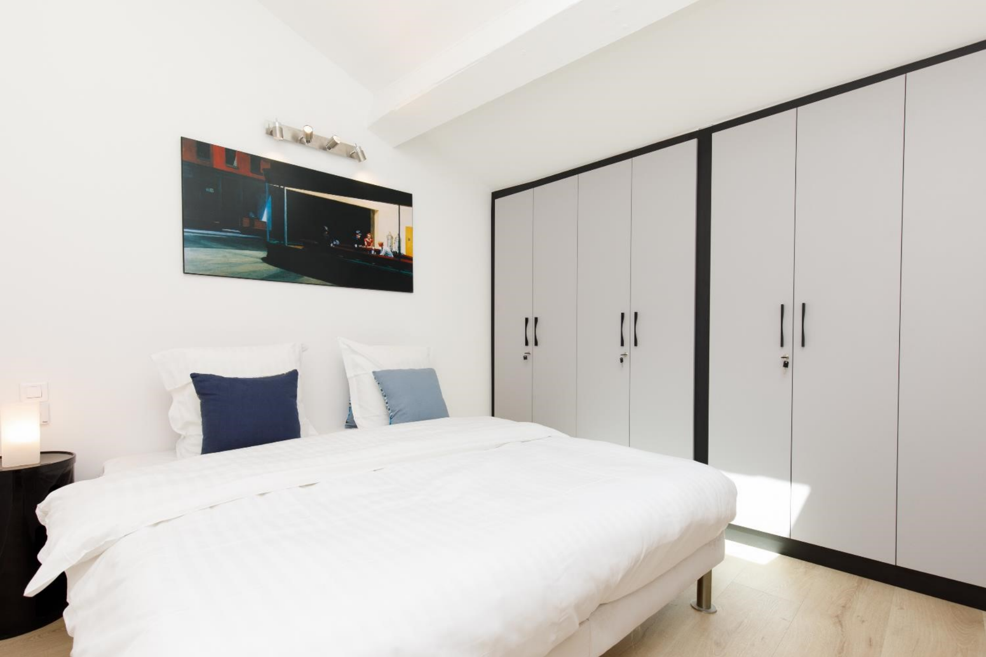
The 2nd bedroom with large cupboards with mirror doors