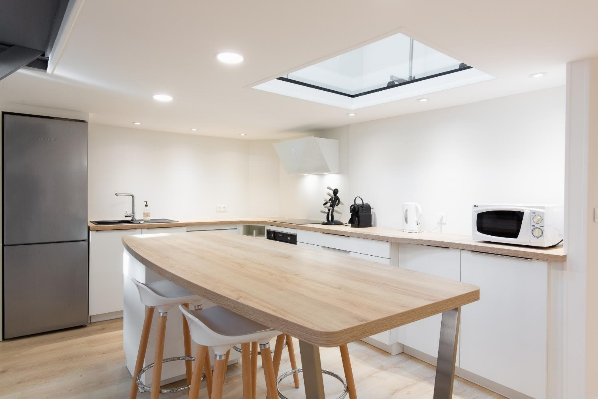
Zoom on the US kitchen