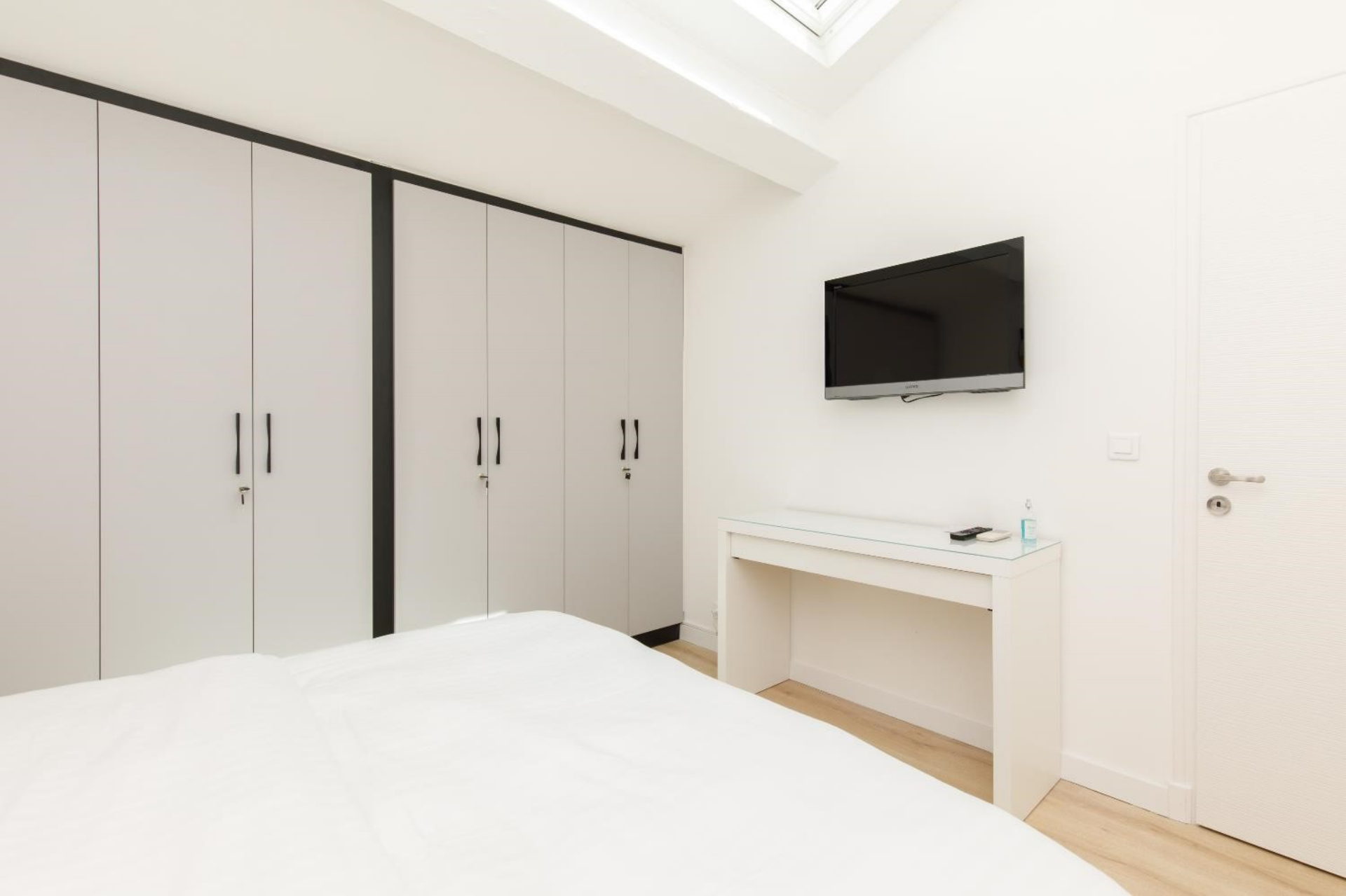
2 nd bedroom with its cupboards and TV